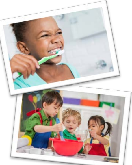
All images in this resource used with permission

Parents and teachers can help children in the early years (F–2) to build understanding and find opportunities to apply computational thinking when carrying out simple everyday tasks. Computational thinking is an invaluable approach to problem-solving in all learning areas as students complete primary education and especially as they move into the secondary years.